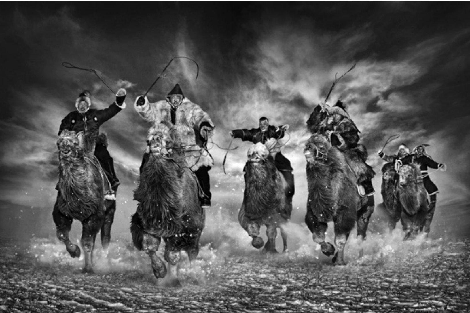
Camel Race