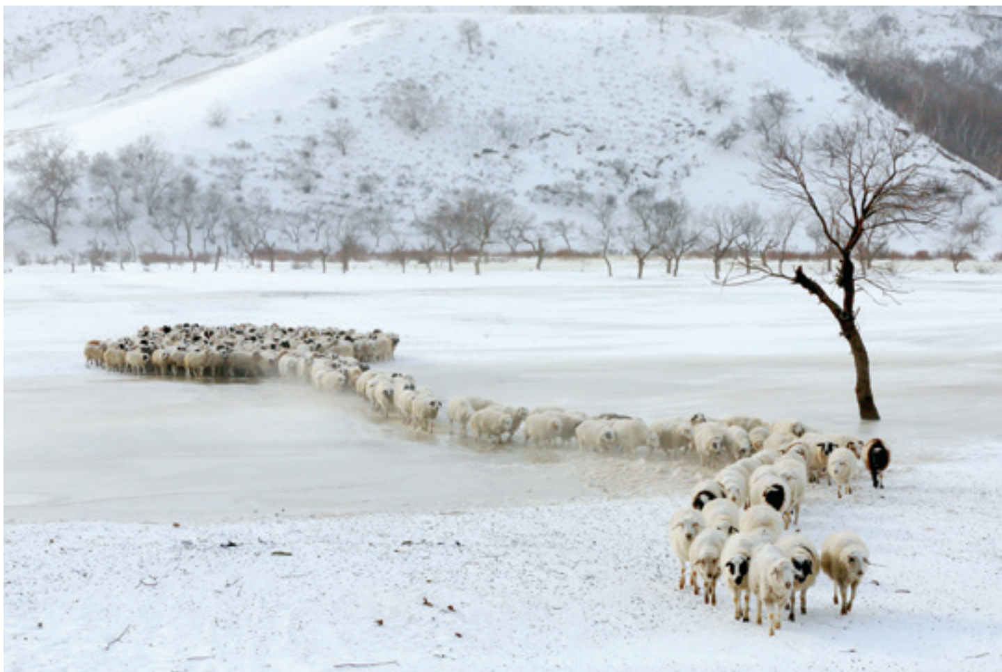
Queue Up