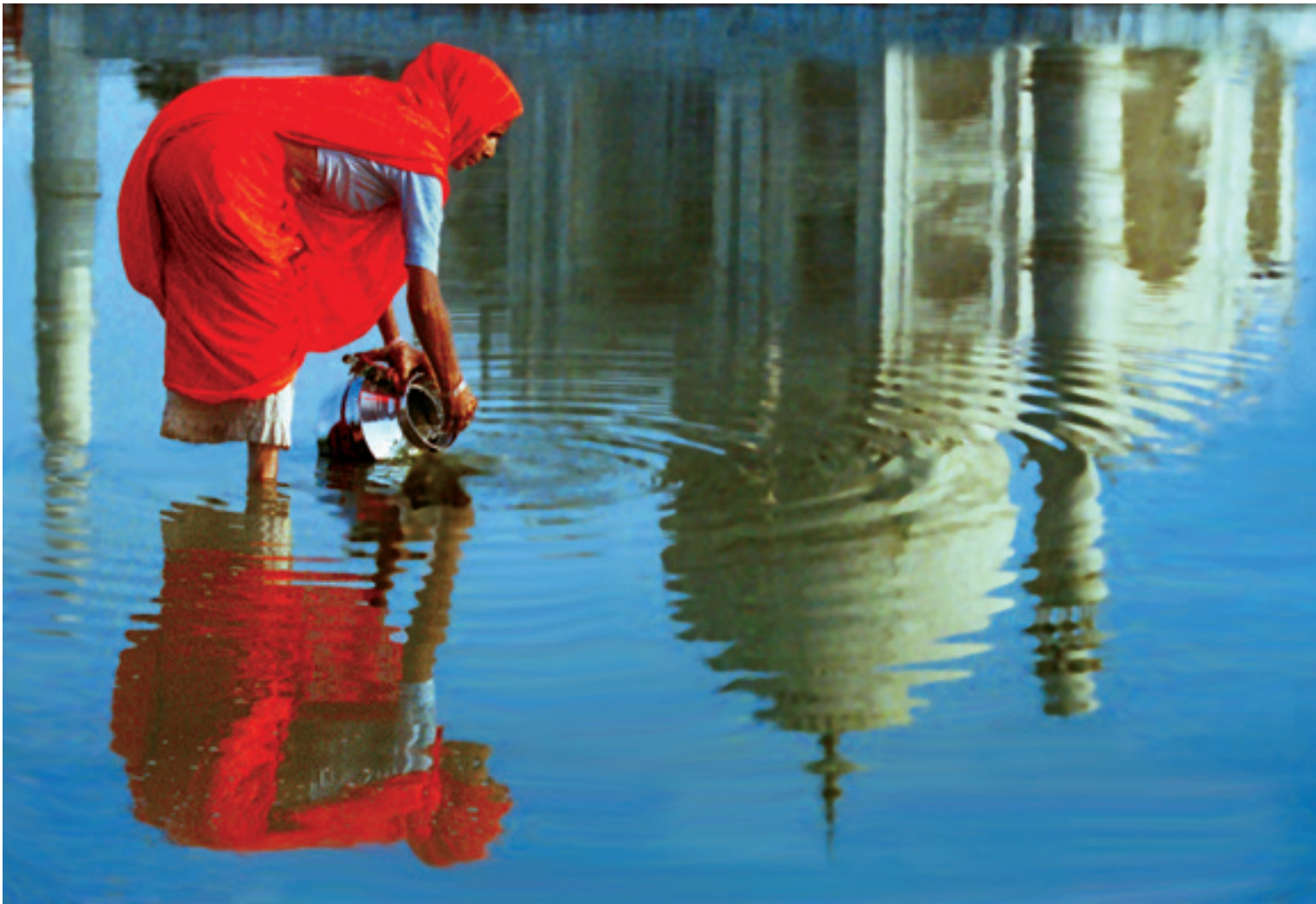
Taj Reflection