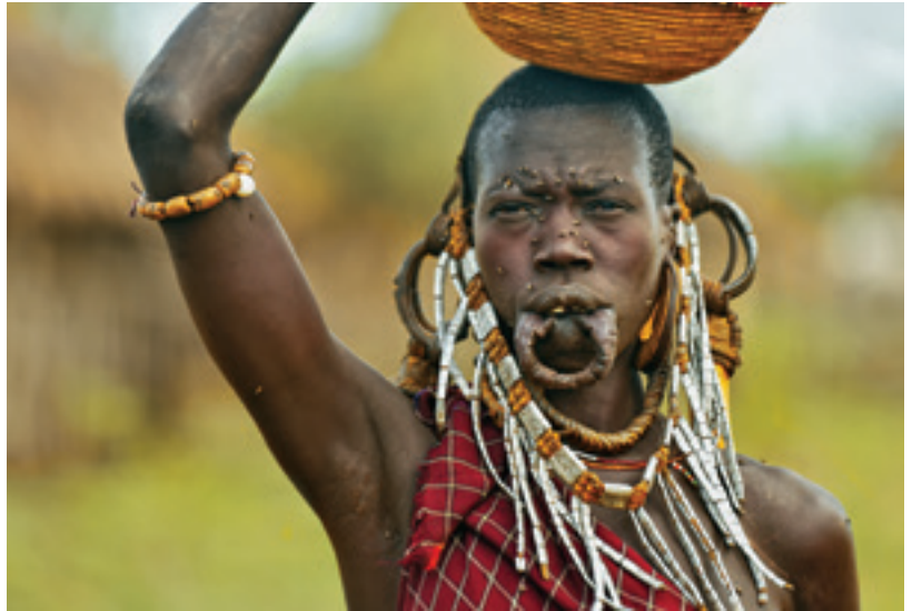
The Lip and Fly © Edwin Ong Wee Kee, EPSA