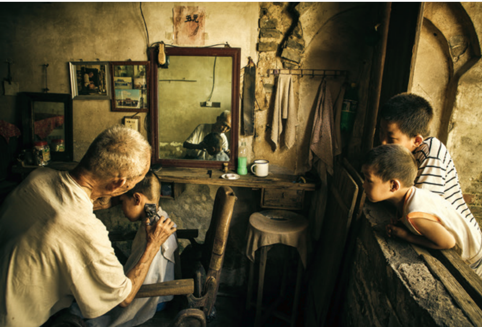
Village Barbershop