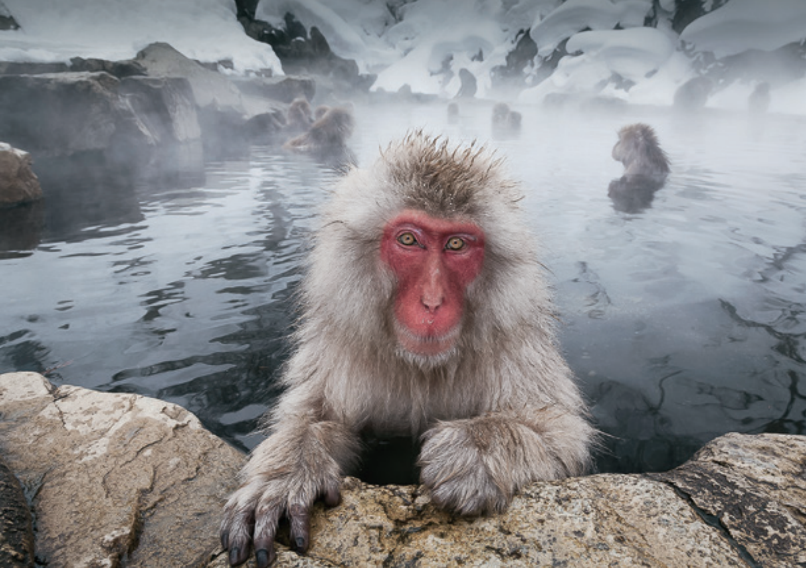
A Piercing Stare