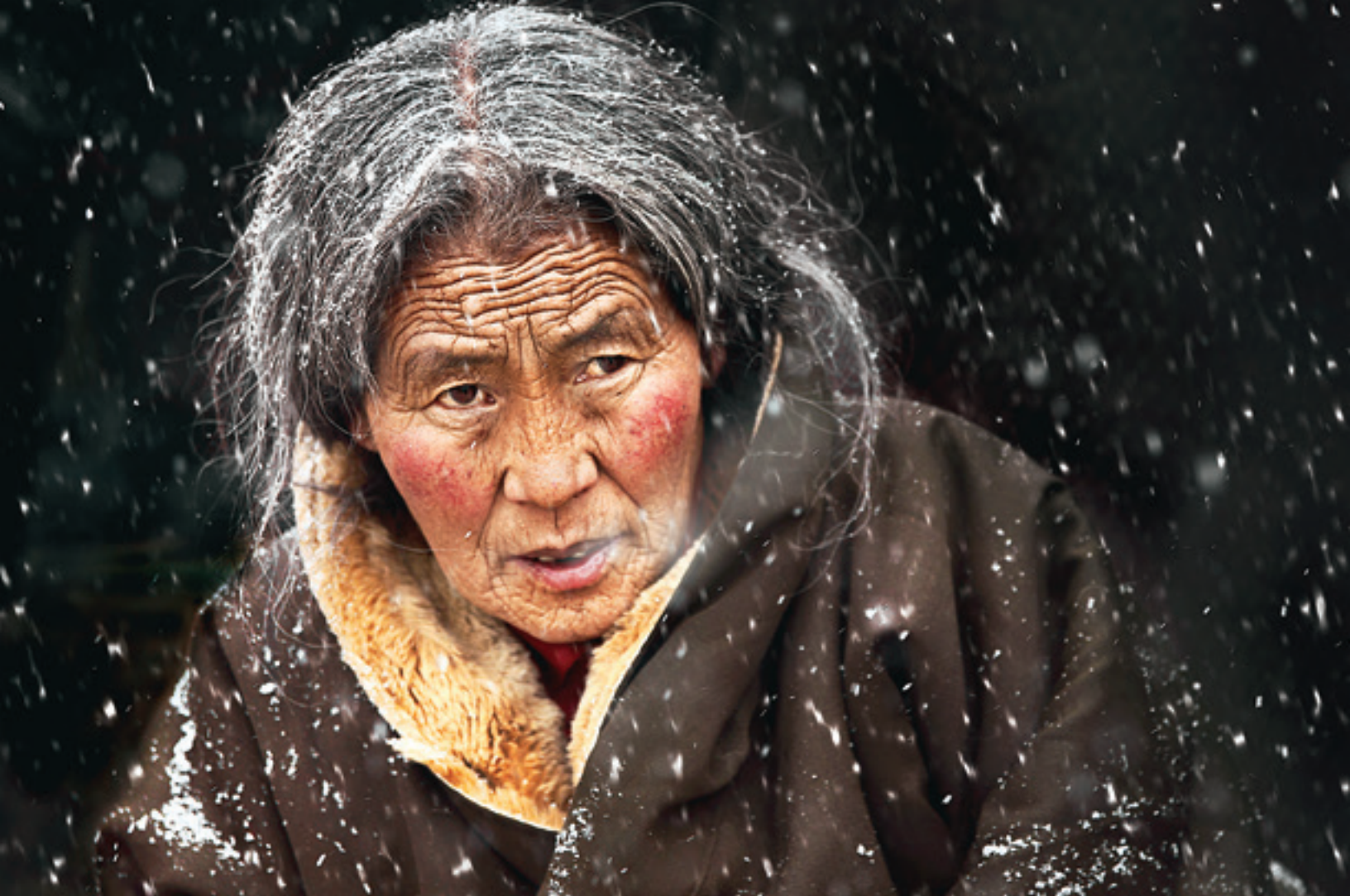
Upset © Chan Yue Yun