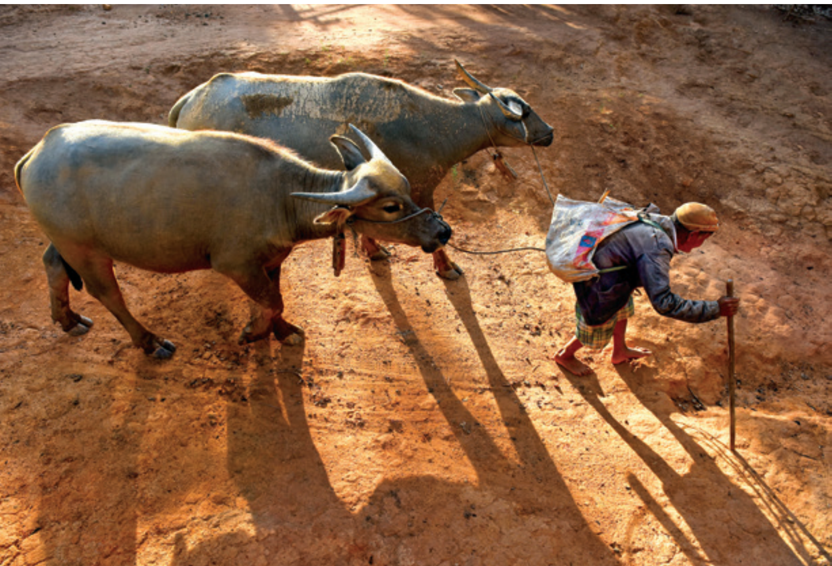
Old Man and Two Buffalo

Salon (1), La Gacilly (1), Lensman (1), Leposavic Kosovo (9), Life Around Us (2), Lightwork (1), Lines (2), Lion City (2), Ljs Shanghai (1), Lofoten (2), Love Story (3), Luxembourg (2), Macao (1), Maitland (1), Malaysia (PSM) (1), Malinik Circuit (8), Malmo (1), Man and Work (1), Metropolitan (3), MFC (10), Midland (2), Miracle Image (1), Mne Circuit (12), Monte Art (3), Montenegro (5), Murshidabad (1), Mystic (2), Narava (2), Natura Naturans (2), New Bi-Continental Circuit (4), Nordic Circuit (4), North American (2), Northern Counties (1), Northwest (NWIEP) (1), Nowruz (3), NSAPK Circuit (12), Oaff Photo Award (2), Obsession of Light (2), Ocean State (1), Odessos (3), Ohrid (1), Oklahoma (1), Olympic (4), One World (3), Ozone (3), Pacific-Atlantic Circuit (3), Pannonia Reflections (3), Pathshala (1), PBK Circuit (12), PCA Circuit (3), PCA Salon (1), Pena Fotografica Rosarina (1), Perasto (1), Perspective (3), PESGSPC (1), PFM (1), Photo Artist (3), Photo Contest Bulgaria (3), Photo Emotion (2), Photo Fest Contai (1), Photo Magic (3), Photo Story Macedonia (5), Photo Vivo (3), Photoart Prague (2), Photoart Vision (2), Photowinner (1), Play Macedonia (2), Plovdiv (4), Point and Shoot (1), Port Talbot (2), Portrait Circuit (12), Print/Digital Art Varna (2), Prism Circuit (3), PSA China Special Theme (1), PSA China (2), PSA International (1), PSNY (1), PSSA (4), PSSM (1), PSSNY (2),