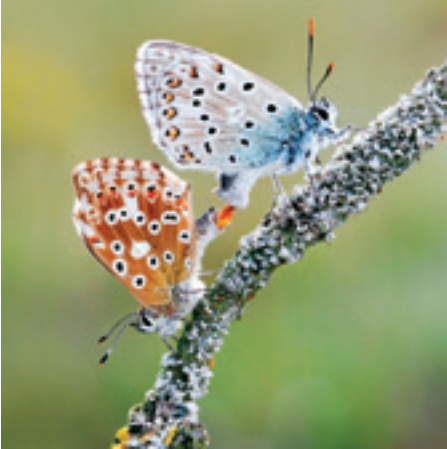
Paring Bleke Blauwtjes