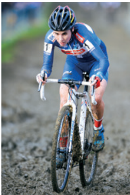
Sanne © Luc Dequick, EPSA