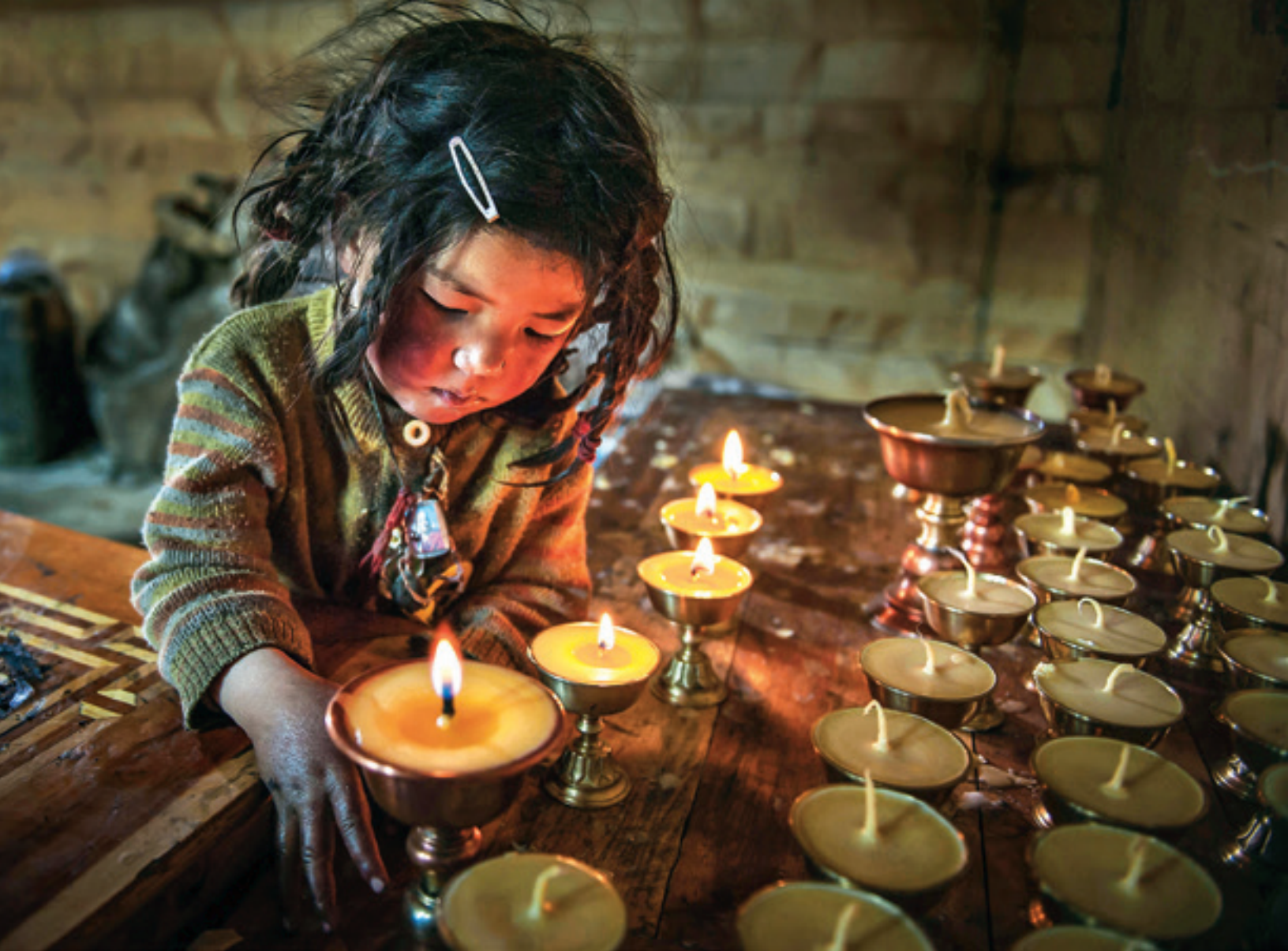
A Pious Kid © Li Peng