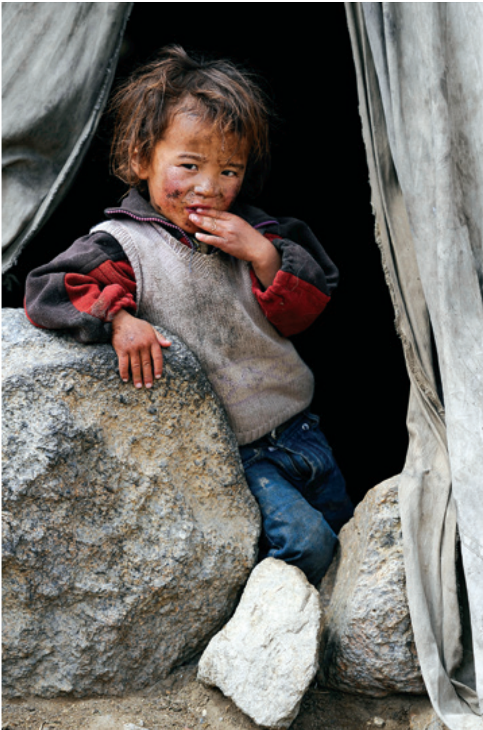
On the Rocks © Luc Dequick, EPSA