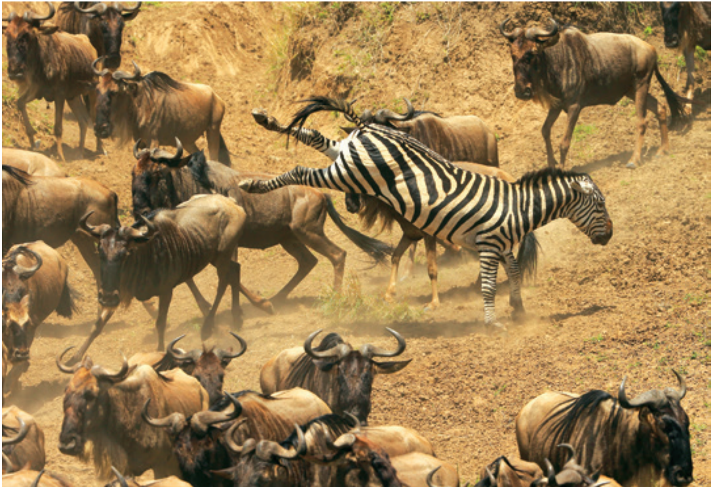
Zebra Anger