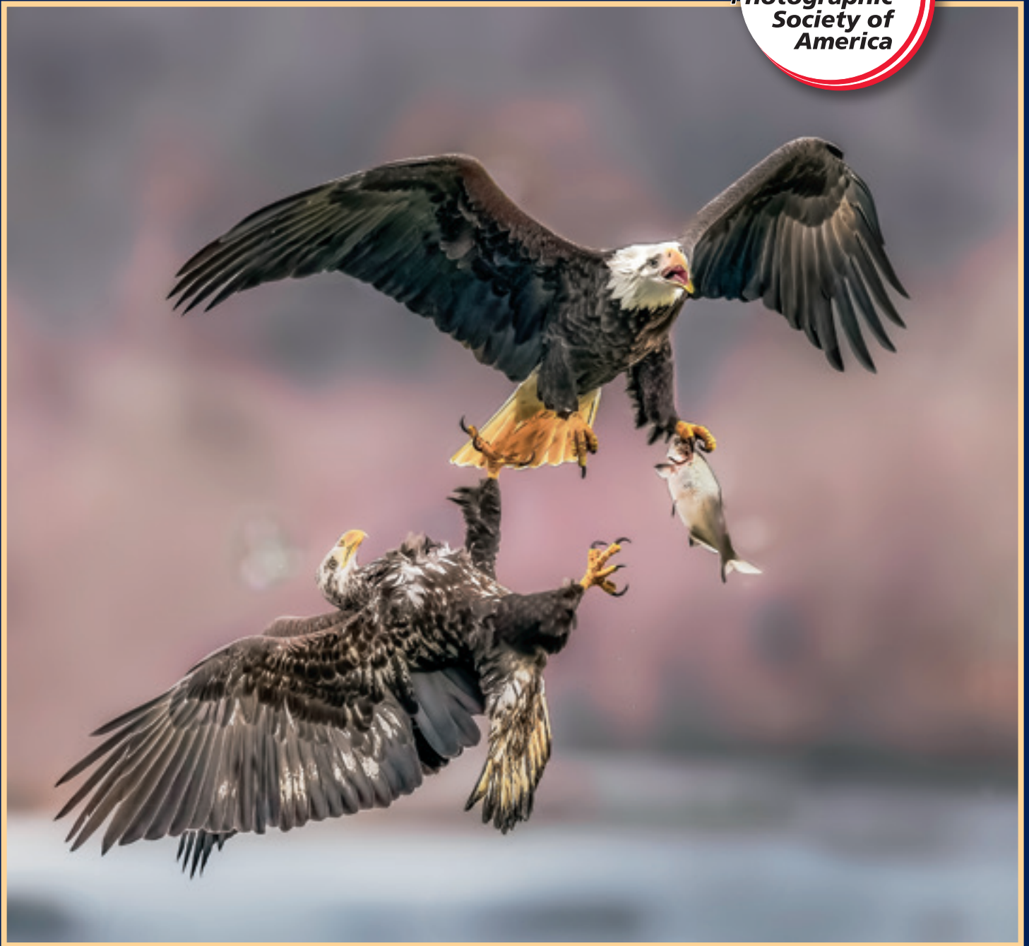
That is My Fish Not Yours

Photographic Society of America Educating and Connecting People through Photography Visit www.psa-photo.org for more information