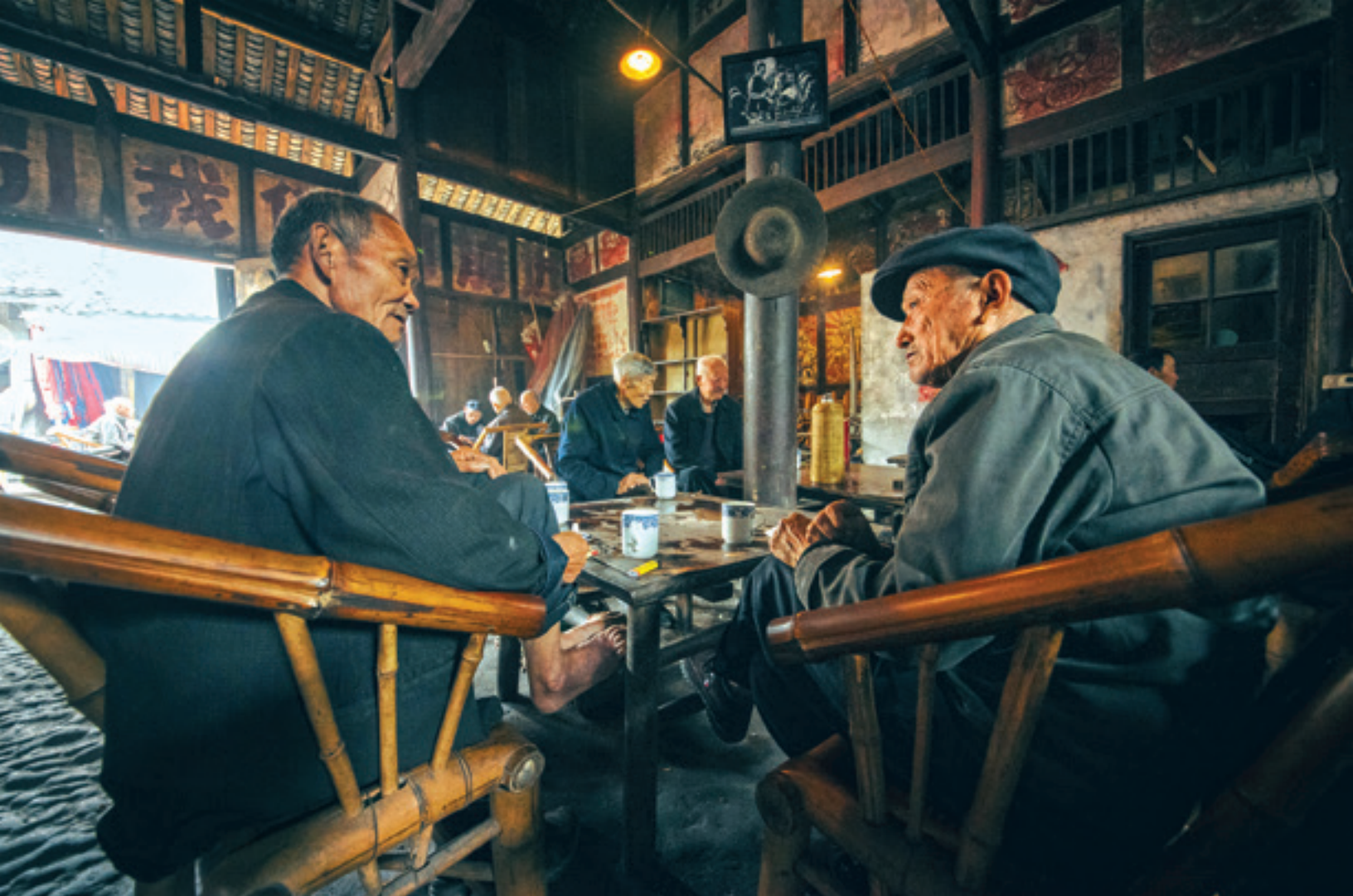
Barefoot Chat © Edwin Ong Wee Kee, EPSA