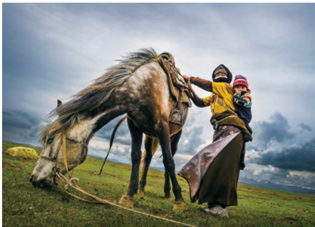
Mother and Kid

Exhibition Judging Scores are posted in the Who's Who area of PSA's website and are updated periodically throughout the year. To view the 2016 Judging Scores, go to PSA's home page, click on Who's Who , and then click on the link, 2016 Exhibition