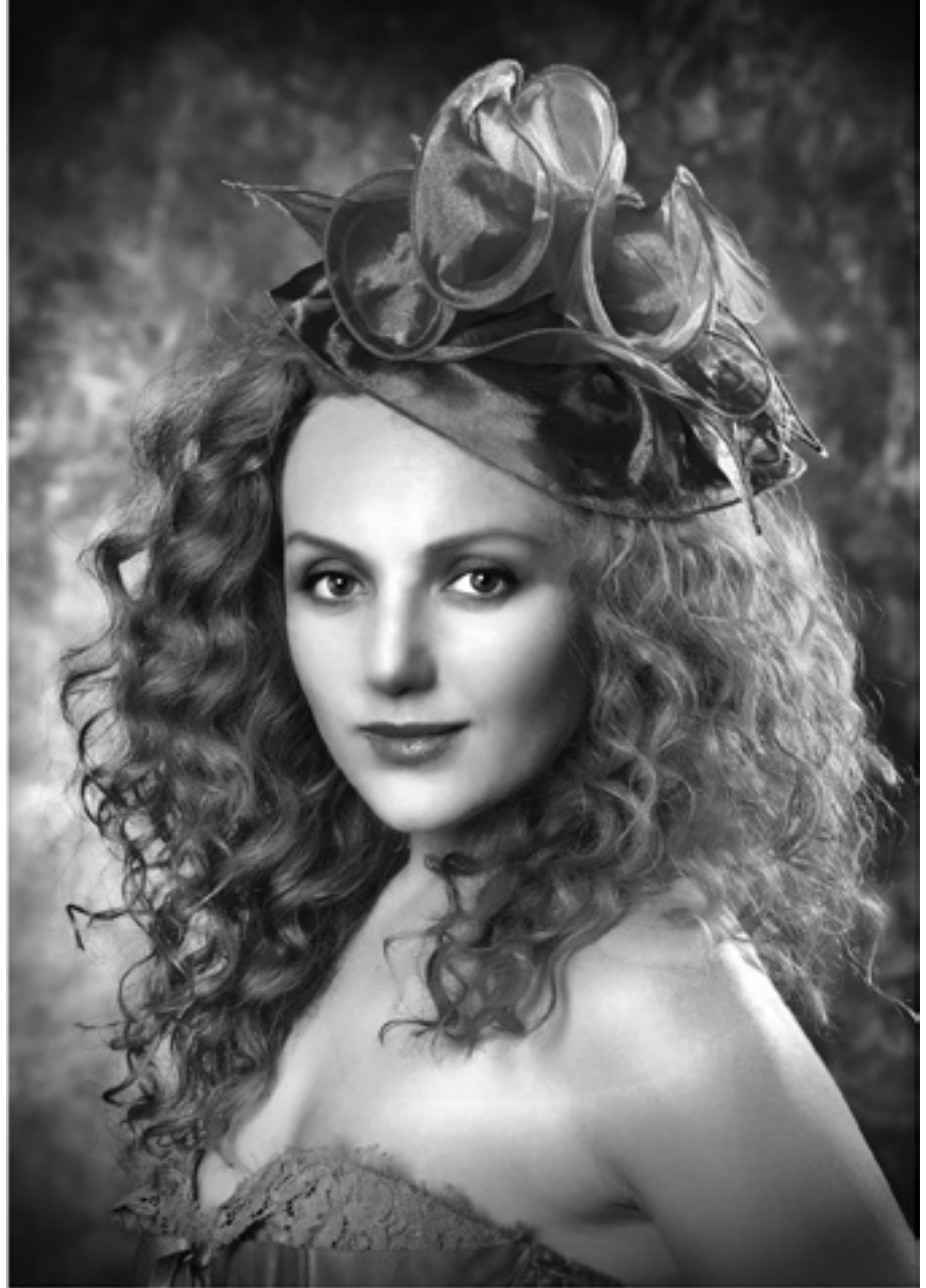
The Fascinator