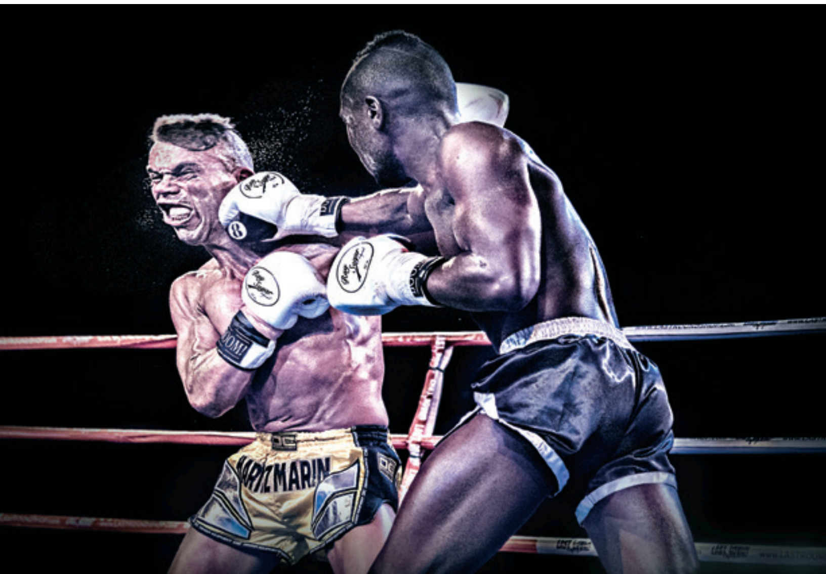
Final Shot