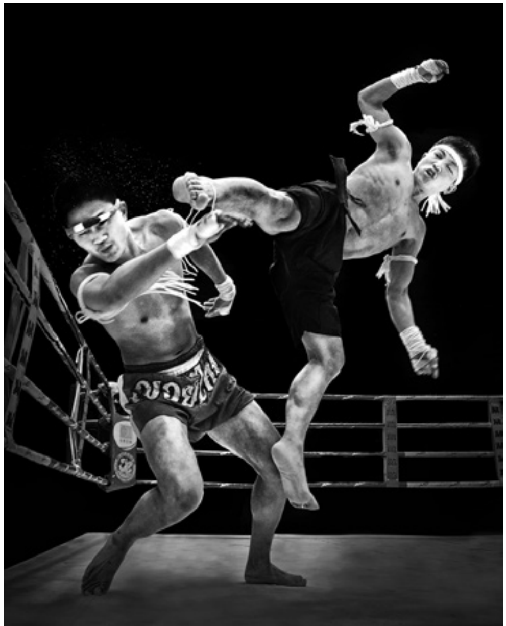
Side Kick © Kai Lon Tang, MPSA