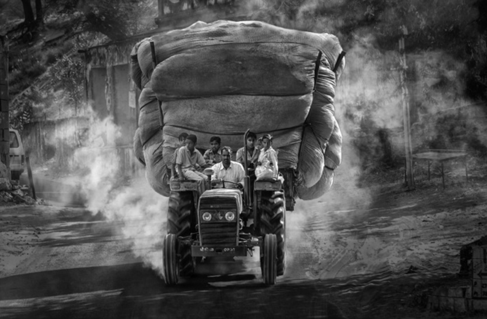
Heavy Load