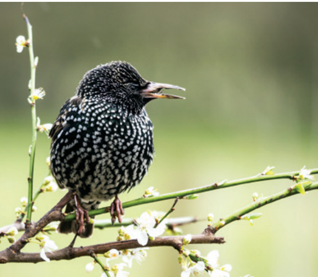
Young Starling