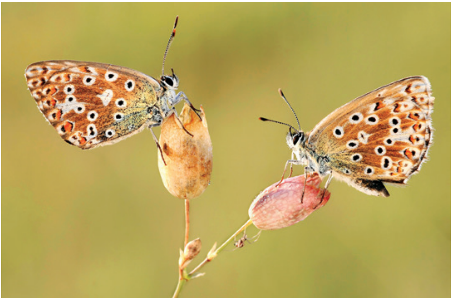
Bruine Blauwtjes