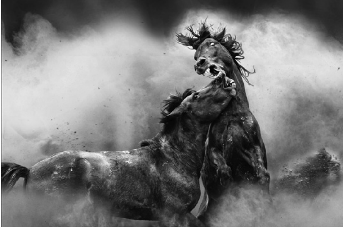
Have No Fear