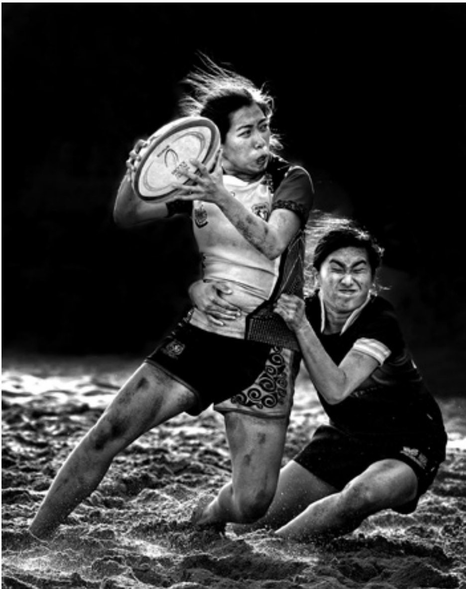
Pull Down 2