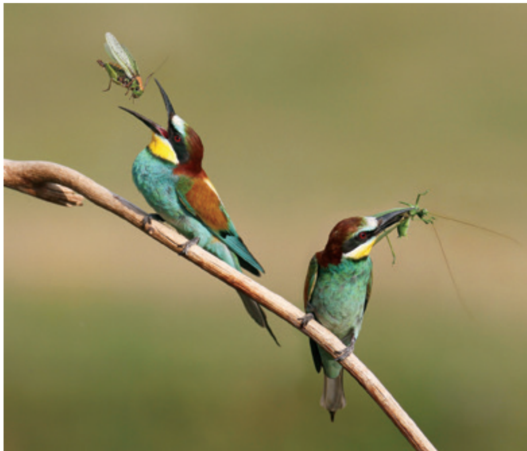
Bee Eaters with Grasshoppers