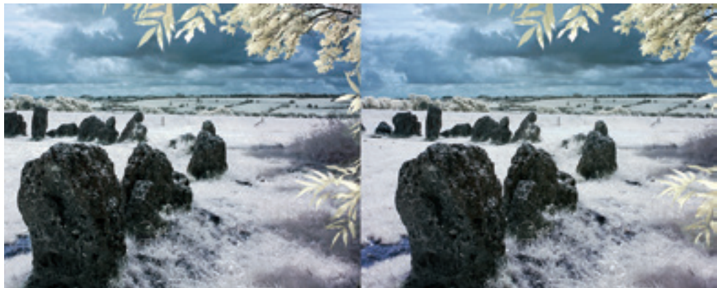
Rollright Summer Day

On the Cover: Rodeo Bull Ride