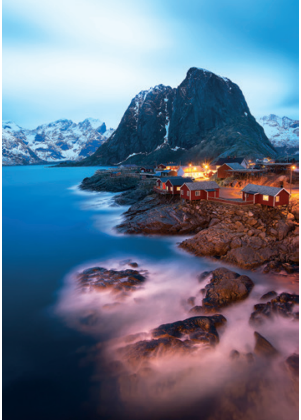
Hamnoy, Lofoten, Norway