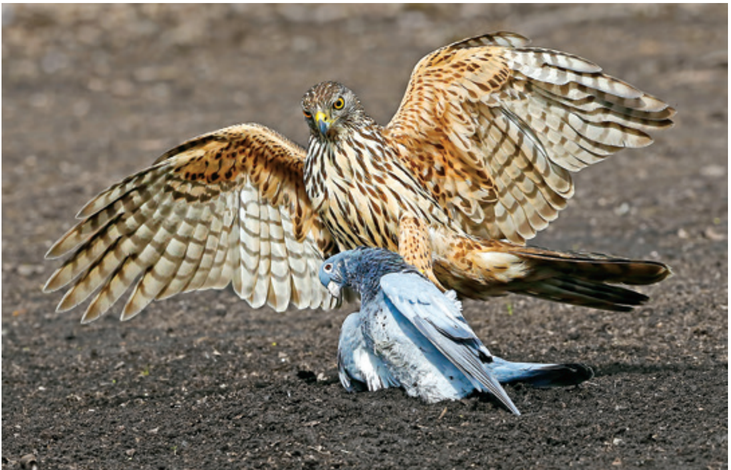
Jagende Havik