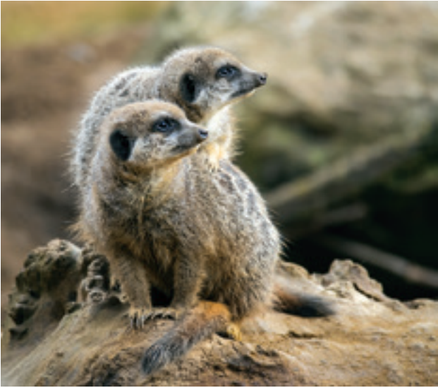
Alert Meerkats