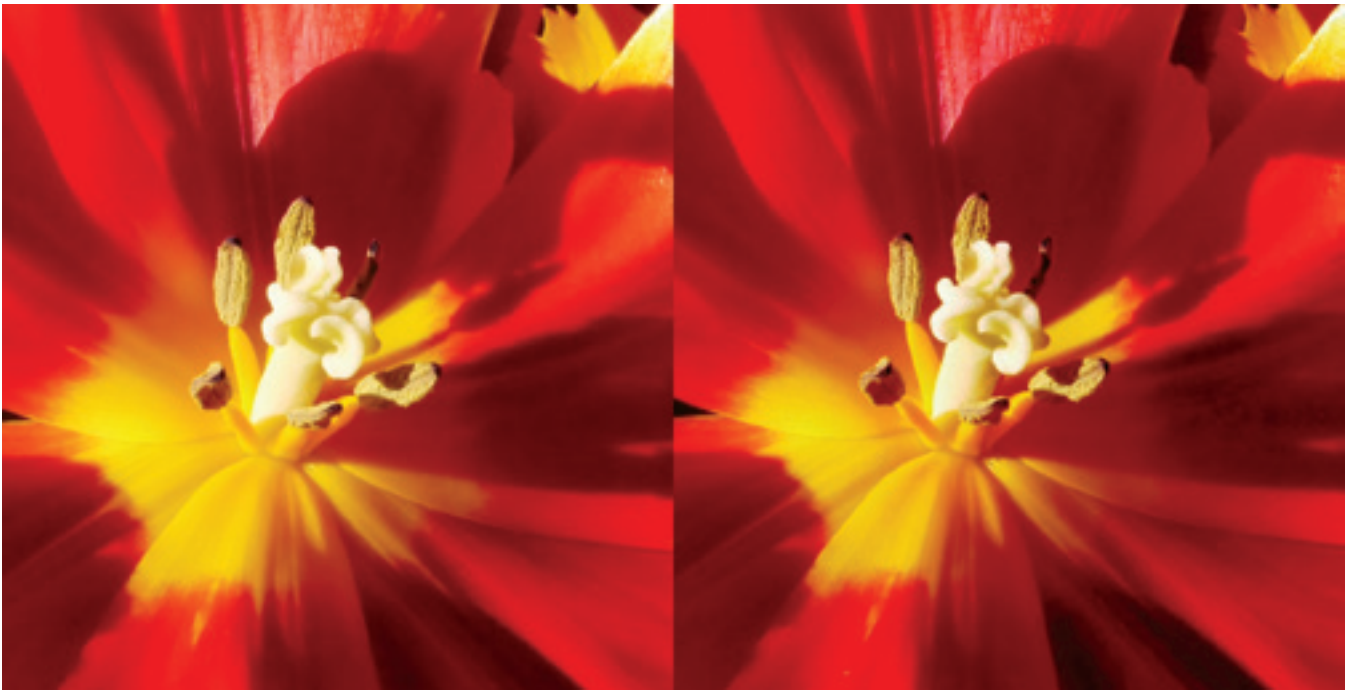
Tulip Portrait