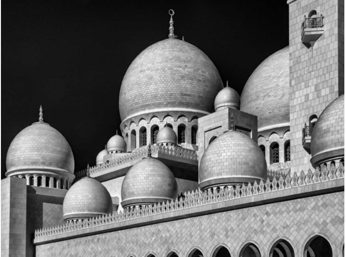
Domes of Sheikh Zayed