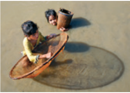
Hard Childhood