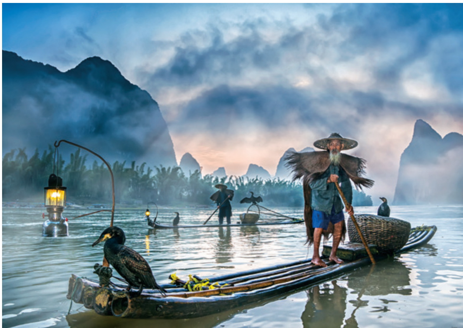
Li River Boat Crossing