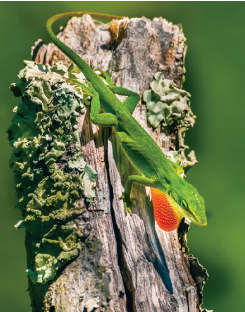
Stressed Anole