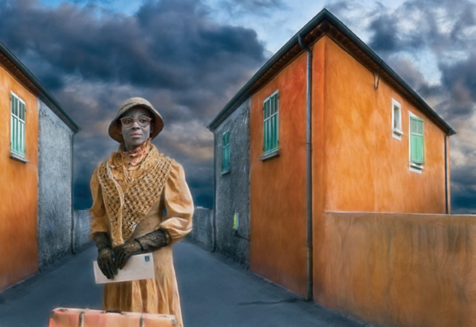
Farewell Letter © Marcel van Balken, EPSA