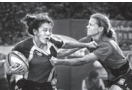
Let Me Go © Kai Lon Tang, MPSA