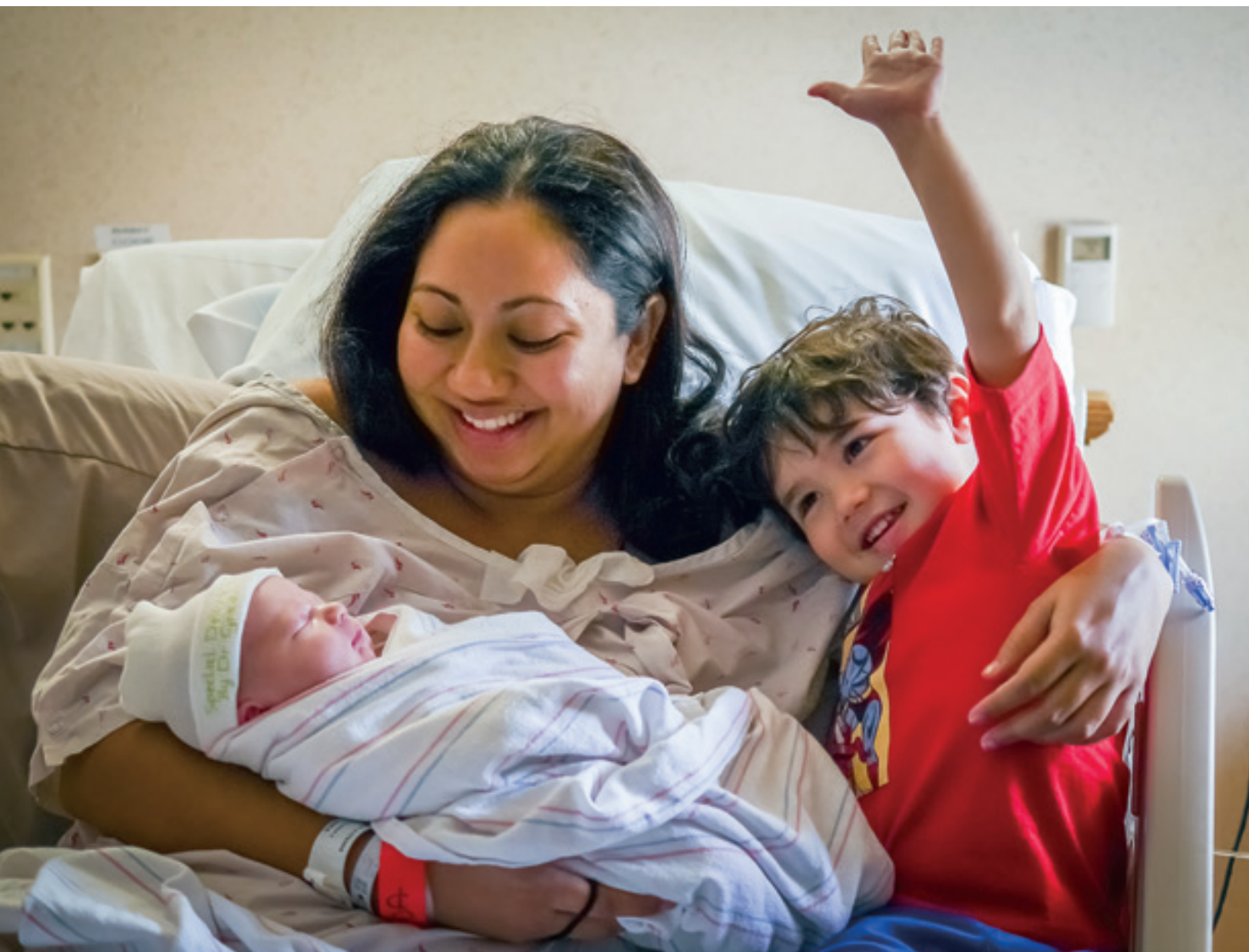
Love at First Sight © David Osberg, EPSA