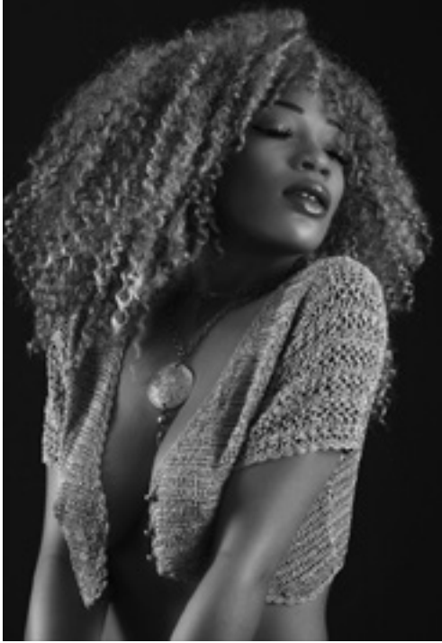
Bongeline in Gold