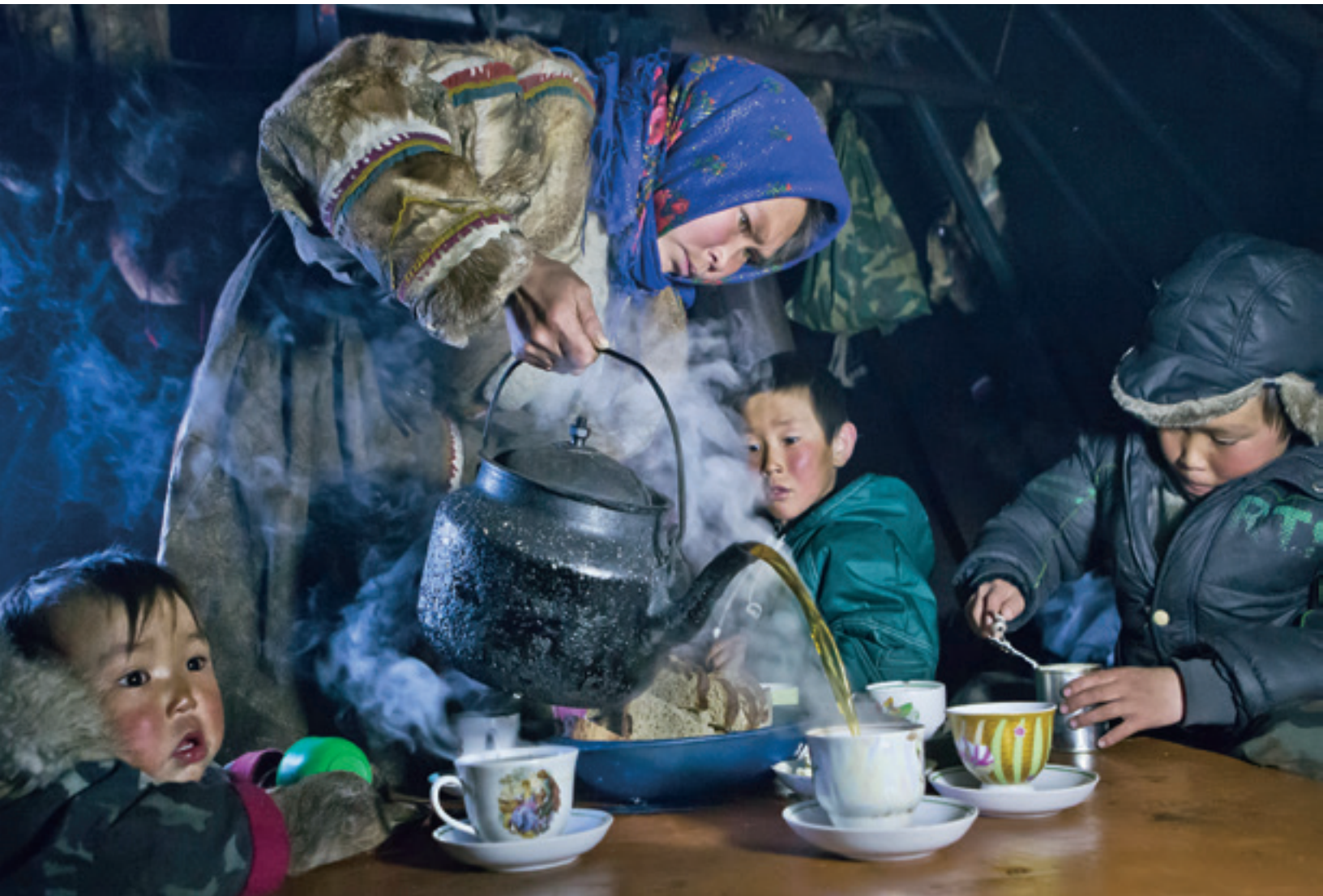
Tea Drinking in Tundra