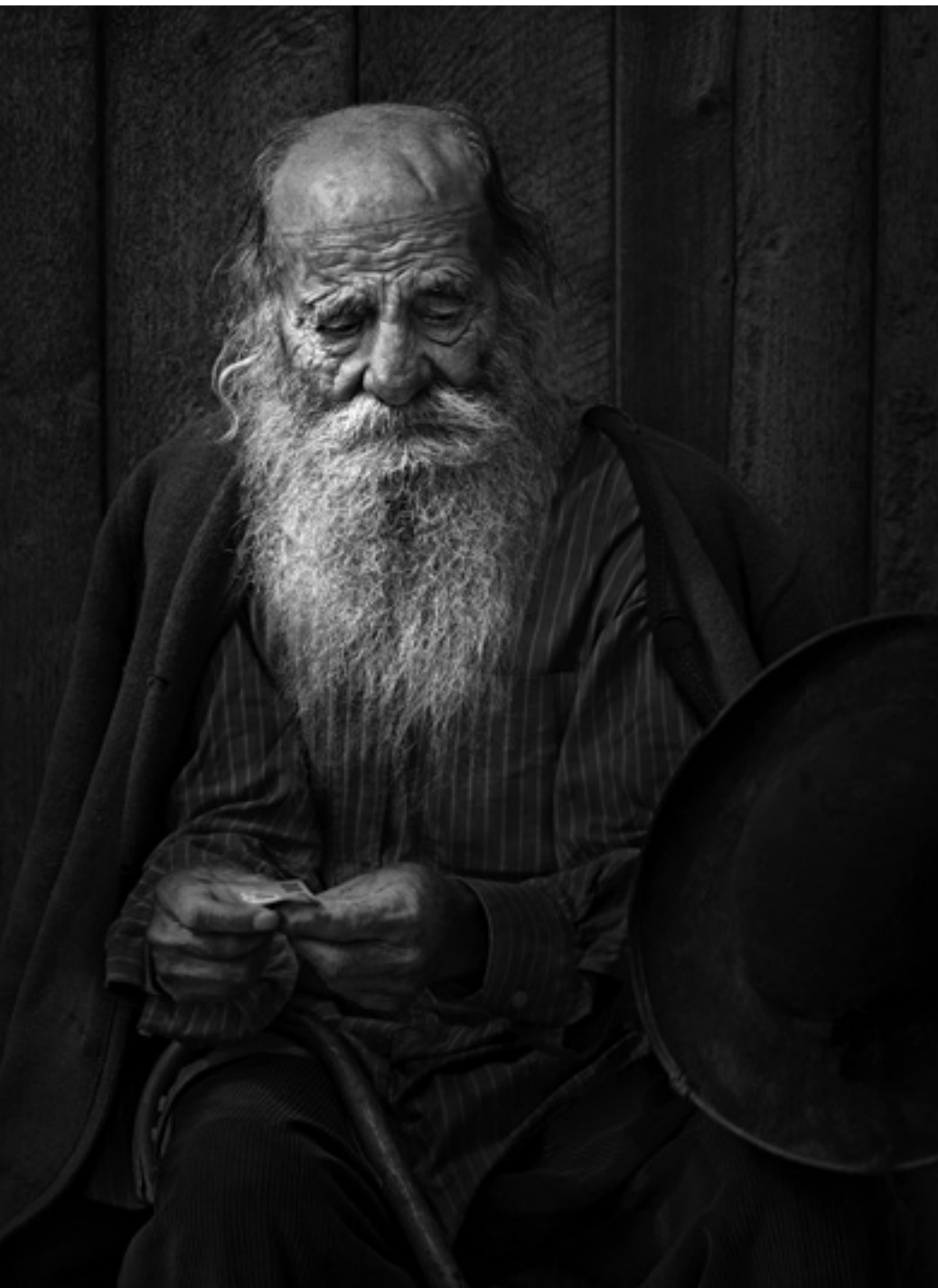
Backshees © Elek Papp