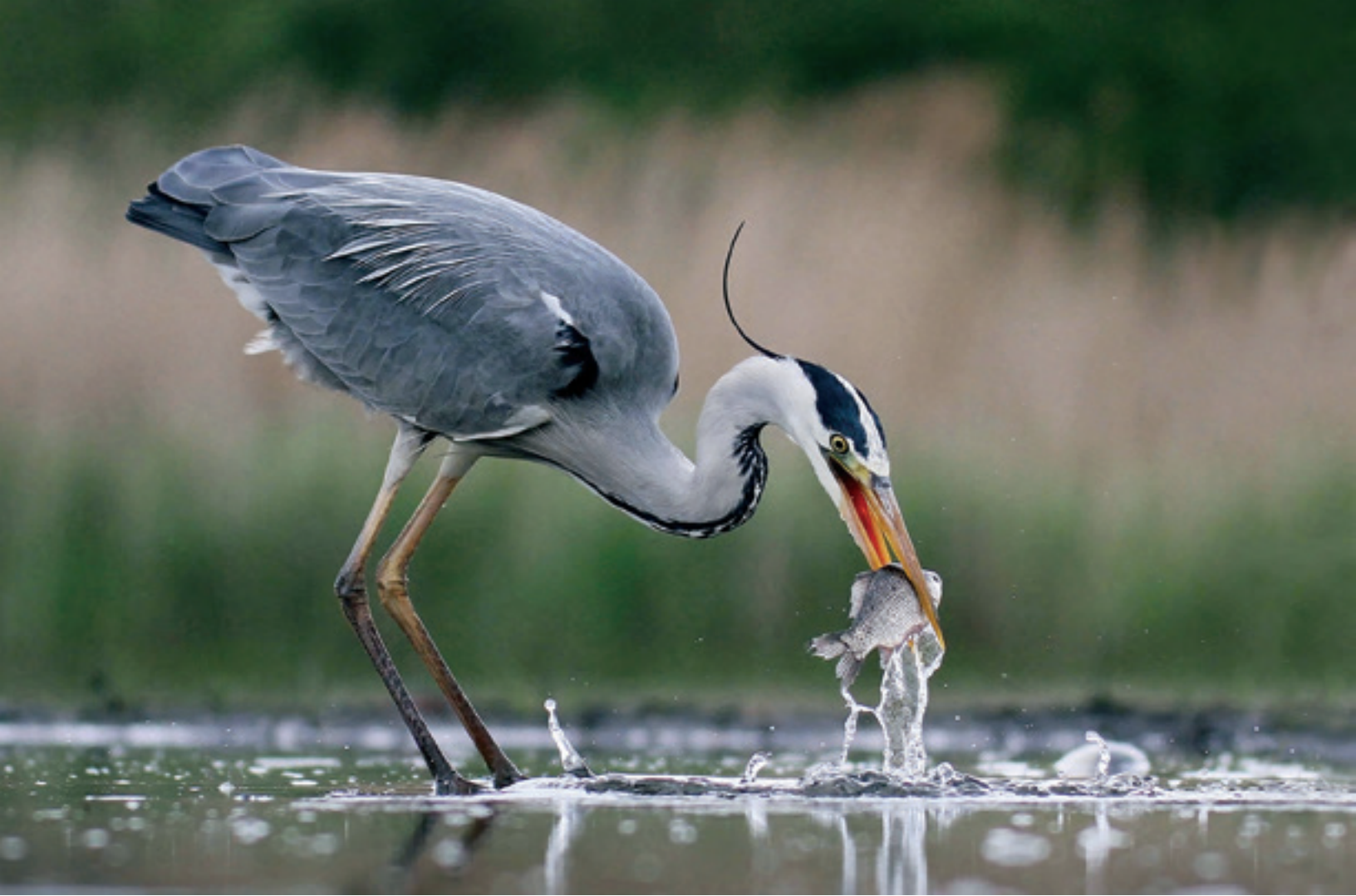
Grey Heron Fishing

The Photographic Society of America (PSA) is a worldwide organization providing a wide range of services that promote photography and benefits to its members. Individual members can participate in competitions, study groups and online education programs designed to advance their photographic knowledge and skills. Competitions are held for clubs, councils, federations and chapters, also. Member image galleries are always available for viewing. An annual youth photography showcase, open to all students of high school age, is conducted as well. Opportunities for image analysis and critique as well as discounts for both hardware and software products are available for all members. In addition to special access to a Member's Only area on this dynamic and informative website, every member receives the high-quality PSA Journal each month.