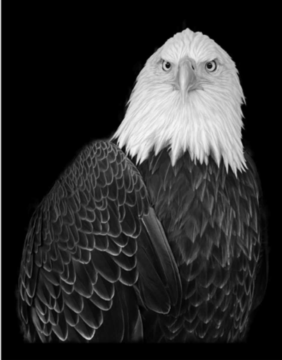
Bald Eagle 5597