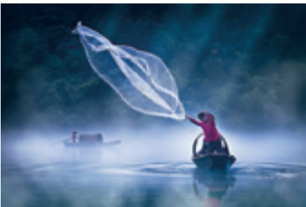
Cast Net in the Morning