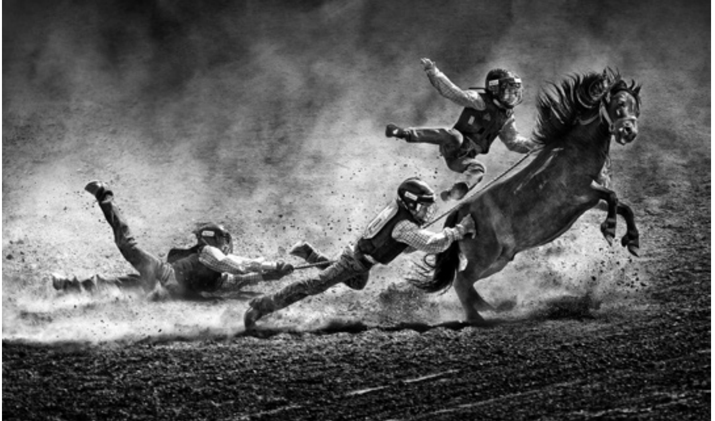
Pony Ride