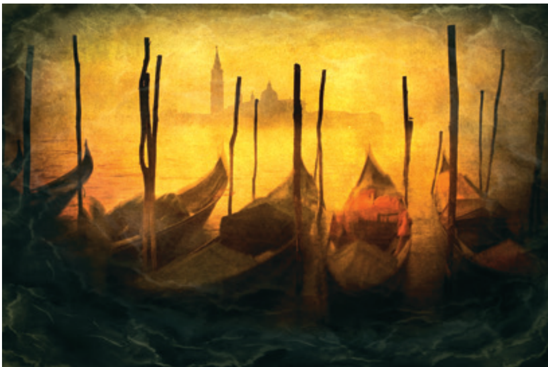
Golden Light © Manfred Kluger

The images published in this issue of the 2016 PSA Who's Who in Photography are from PSA members who ranked high in the Top Exhibitors boxes in 2015. The members were invited to submit images and some of the photos were chosen for publication.