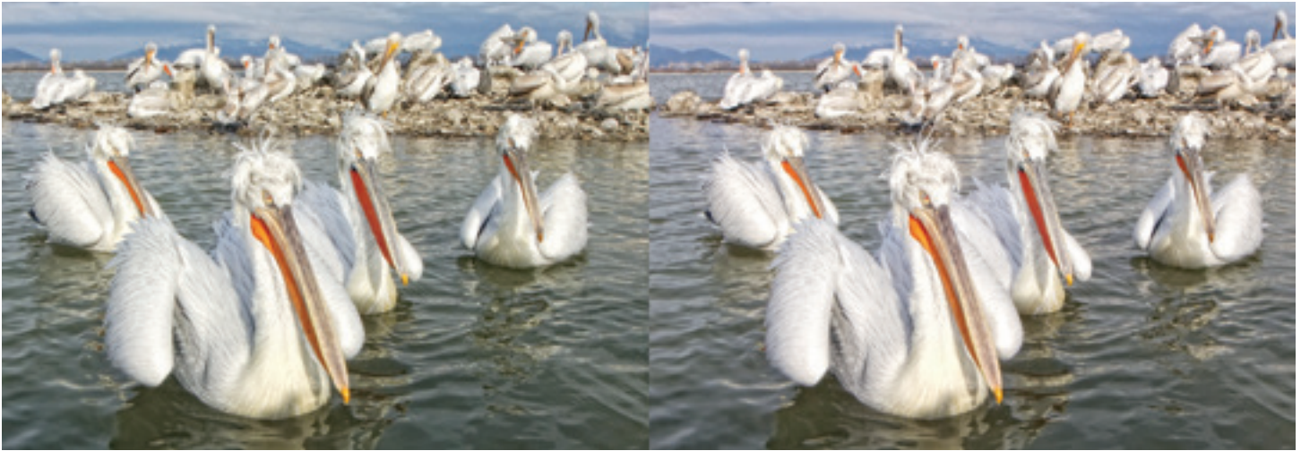
Dalmation Pelican Group