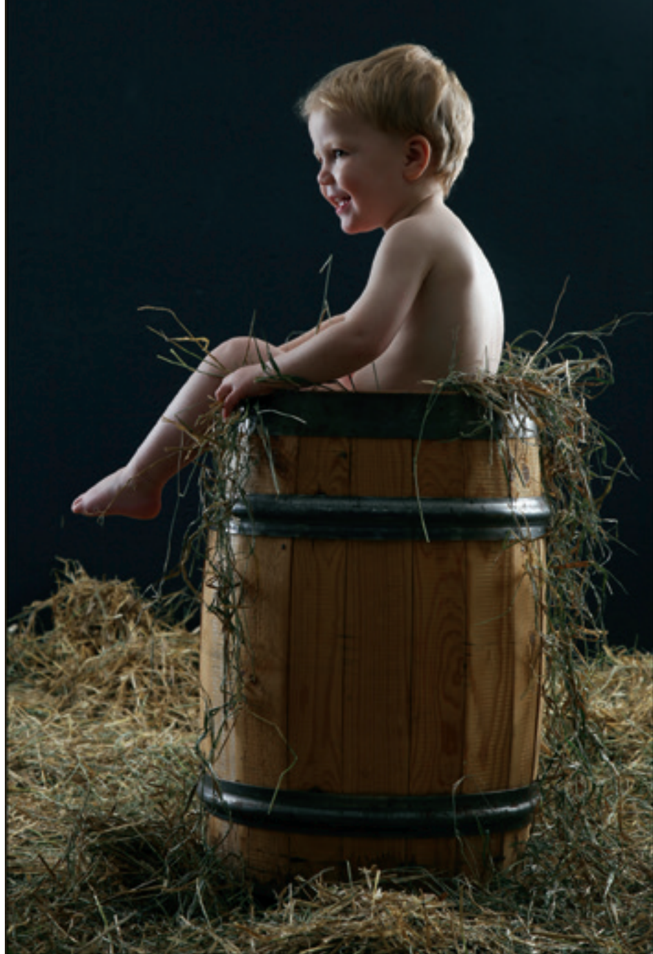
I'm Stuck