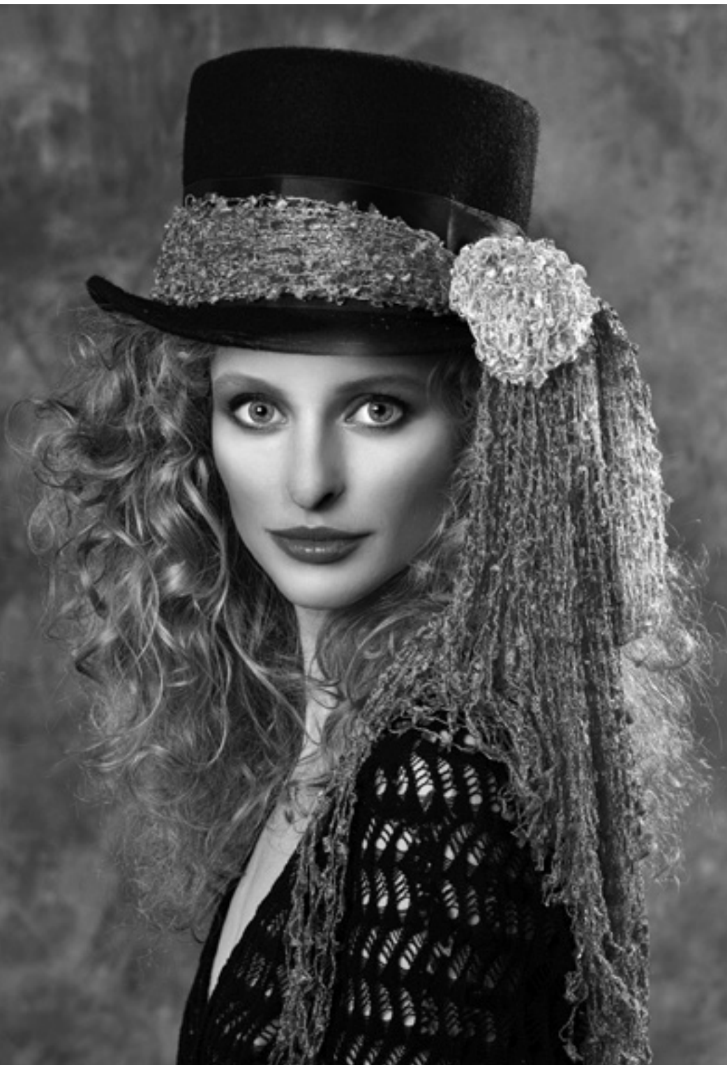
Topper Style

The following PSA-recognized exhibitions are included: Art Dunes (1), Cacak (1), Central Washington State Fair (1), CHKFPA (1), Dum Dum Salon (1), E.A. Hong Kong (1), Festicolor (1), HKCC (1), Hong Kong (PSHK) (1), Maitland (1), Midland (1), Northern Counties (1), Northwest (Nwiep) (1), Print/Digital Art Varna (1), PSA International (1), Riedisheim (1), SAP Print (1), Scottish Salon (1), Shadow (1), Singidunum (1), Smederevo (1), Smethwick (1), Southampton (1), Special Themes Circuit (4), Tallaght (1), Toronto (1), Trierenberg Super Circuit (4), Tulle (1), Wilmington (1).