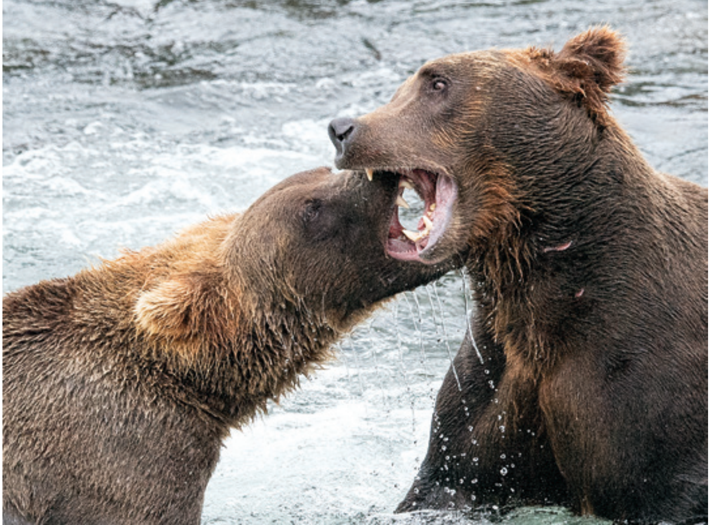
Bear Fight © Koon Nam Cheung, MPSA