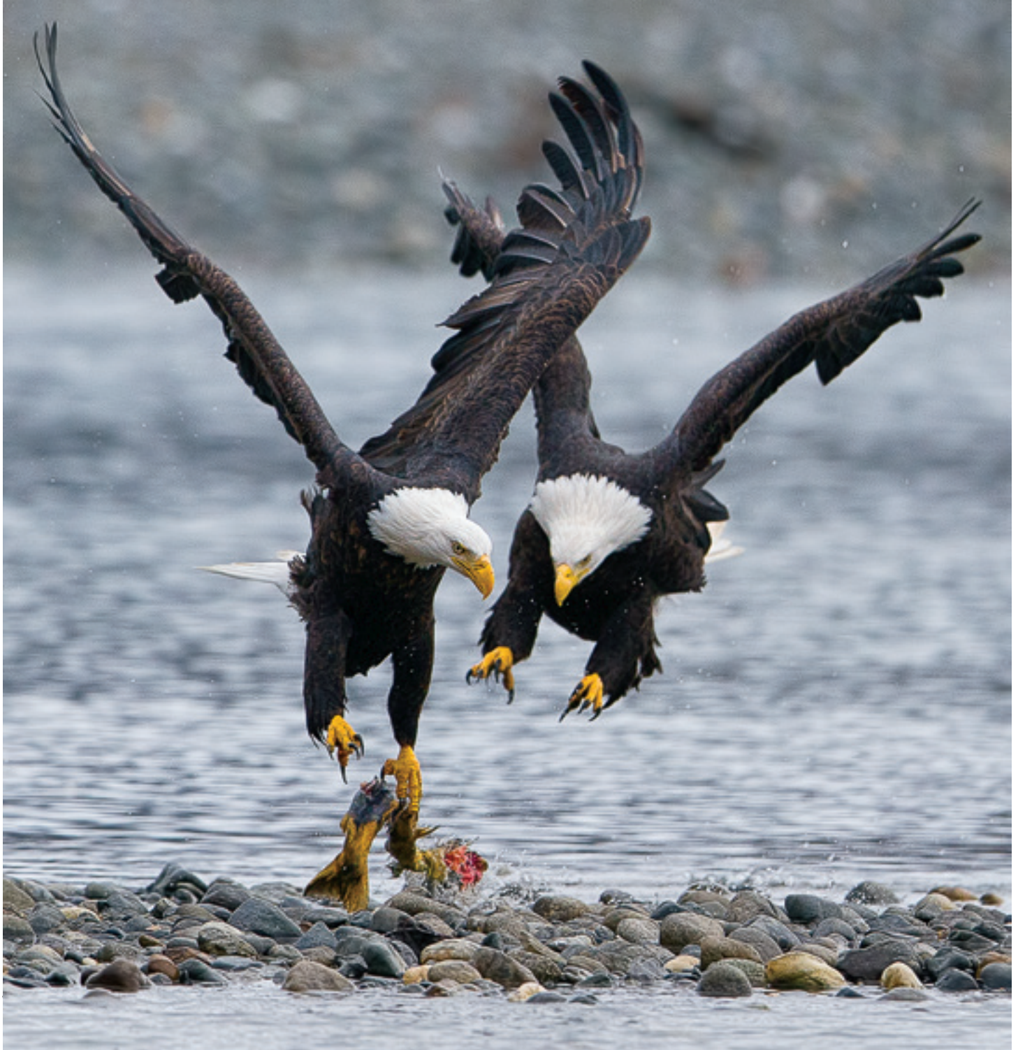
First Come First Served © Francis King, MPSA